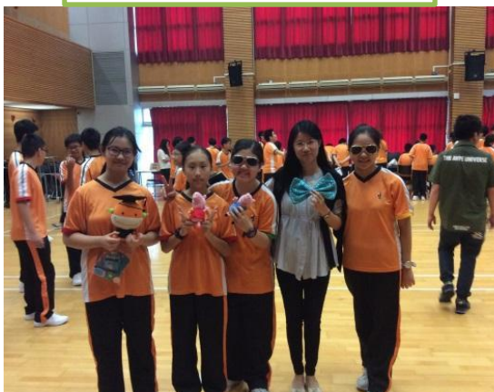
S1 Students tried out an intriguing mock society experience.