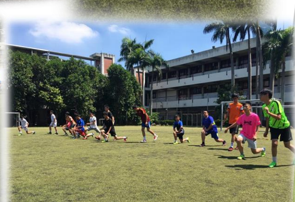
Soccer Friendly Match with Taipei Beitou Junior High School