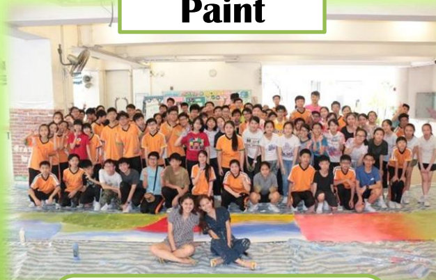
S2 Students had great fun painting in the activity "Messy Paint".