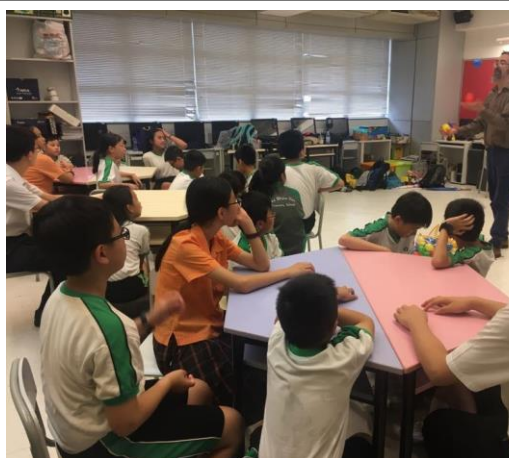
HLC students had fun in a juggling workshop with HKFYG Lee Shau Kee Primary School students!