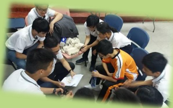
St. John Cadet's members held a camp outside school in July.