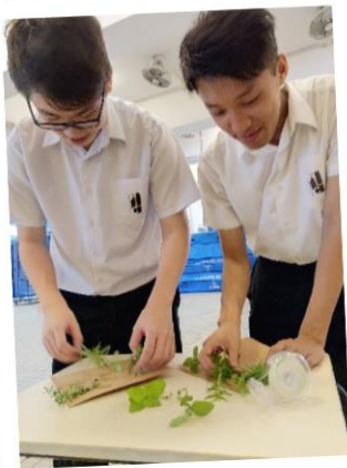
Students making organic herbal bouquets for Mothers.