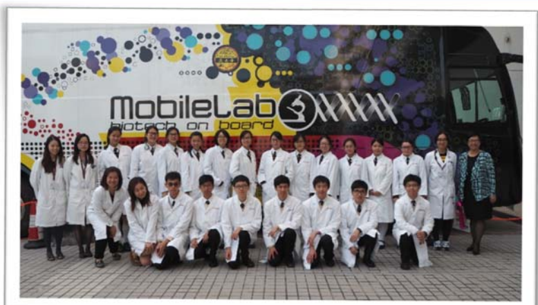
STEM Week Activity: Biotechnology experiments on the Mobile Lab from Sik Sik Yuen