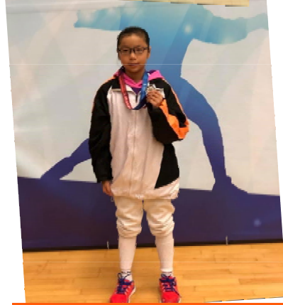
New Territories Inter-secondary School Fencing Competition