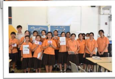
Highlights of English Week's Aboriginal Art and Calligraphy Workshops