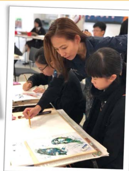
Art Jamming Expressive Watercolor Workshop