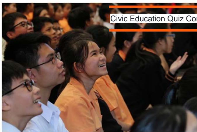
Civic Education Quiz Competition