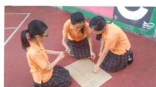
Organic farming course