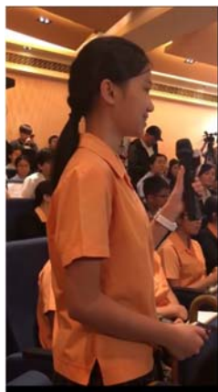
Meeting our Chief Executive Mrs Carrie Lam.