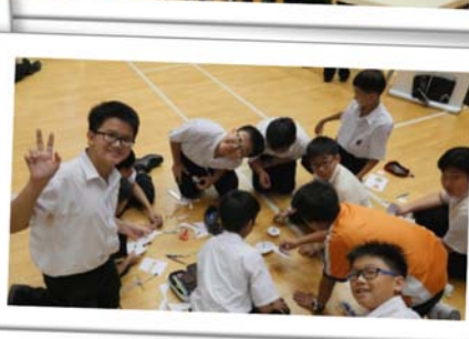
Discover e-Engineers Workshop