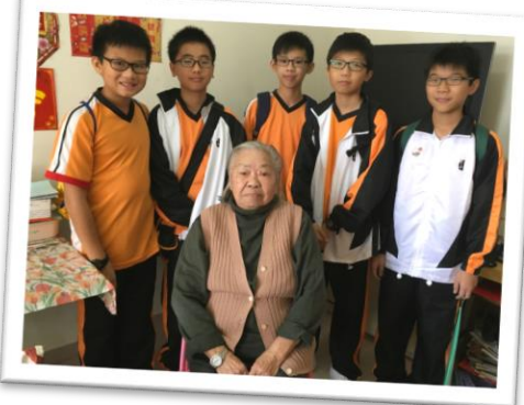
Serve with Love; Love to Serve Our students learnt the value of service through discussion of the needs of the elderly. They then showed their love and care through doing housework for those living alone.