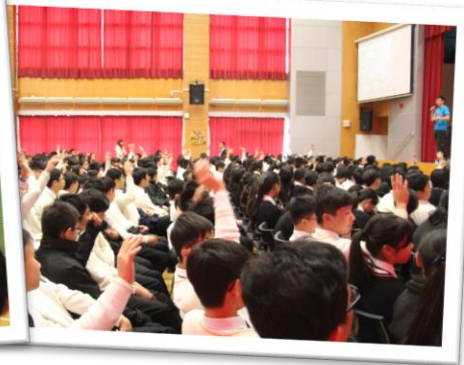
Assembly talk "Children in Wars" by Red Cross The talk explored the challenges children face in wars and inculcated humanitarian values and a more positive response to such tragedies in our students.