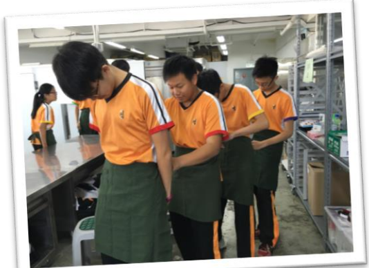
Love to share; Share to Love HLC students made bread which they gave to the elderly who pick up cardboard on the streets of Sham Shui Po. The 'Equal Sharing Movement' promotes a passion for equality through the act of giving and sharing in the community.