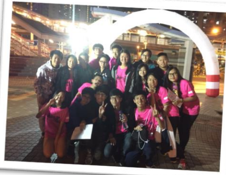
Run for LOVE and CARE 3.0 Fun Run by YMCA Tin Ching Centre HLC volunteers visited people in need to give them presents and share the love and joy of Christmas.