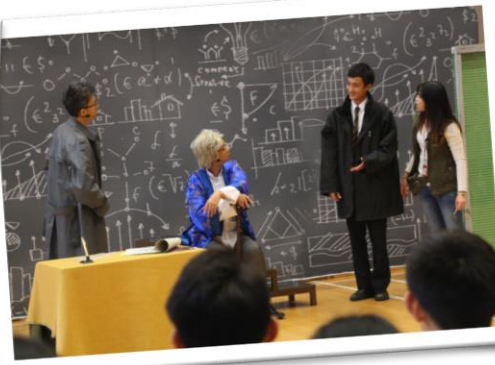
Interactive Drama Show for S.4 students by ICAC X Chung Ying Theatre Company The show advocates the message of anti-corruption and students were taught how to make wise choices in life.