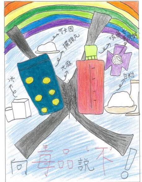
3A Mok Yi Lam