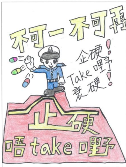
3A Leung Hoi Chin