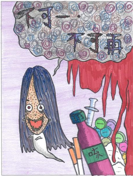
3A Siu Wing Yu